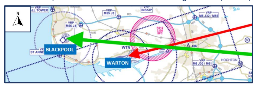
Figure 1- Image depicting relative positions of Warton & Blackpool