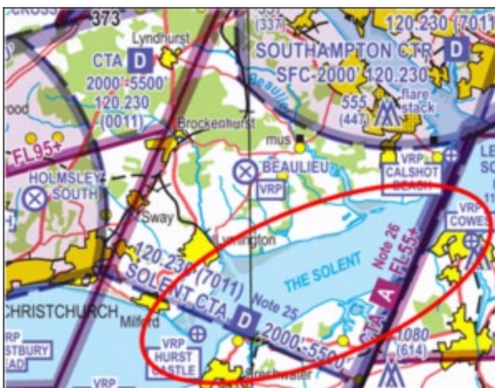
Figure 2 Hot-spot a - Solent CTA 2 (AIRAC 06/2023)

When flying over the water, pilots aim to fly as high as possible and then inadvertently exceed the 2,000 feet AMSL base. This may be compounded by flying on the incorrect altimeter setting where the Southampton QNH should be used. The correct Southampton QNH should be used and can be obtained via several sources such as the Southampton ATIS (130.880 MHz), when monitoring 120.230 MHz when using the Solent FMC; VOLMET on 128.600 MHz (London VOLMET) or simply by asking Solent Radar on 120.230 MHz.