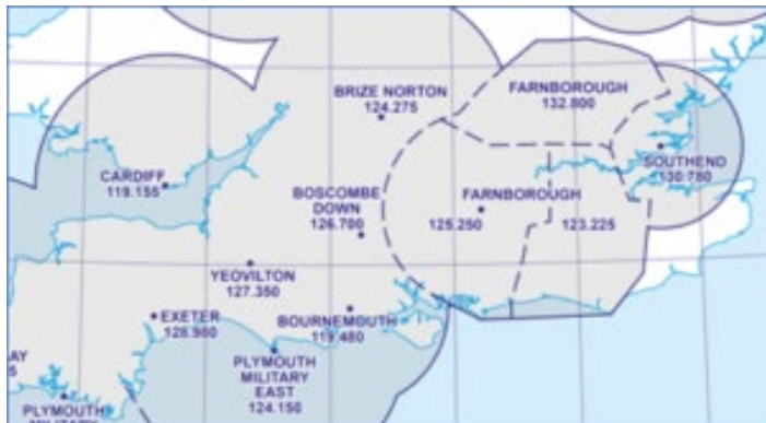
Figure 6 Extract from ENR 6-1 (LARS) AIRAC 06/23

If you would prefer to obtain an ATS rather than use an FMC, then a LARS is provided by Farnborough Radar to the north and northeast of the Southampton CTR, by Boscombe Down to the north and northwest of the CTR, and by Bournemouth Radar to the west, southwest and south of the CTR. All services provided by LARS are in line with CAP 774 – UK Flight Information Services.