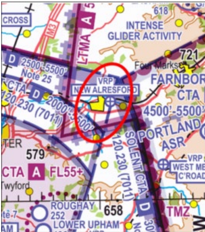
Figure 4 Hot spot c - Solent CTA-3 CTA-5 (AIRAC 06/2023)