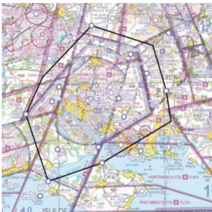
Figure 5 Recommended Solent FMC area (AIRAC 06/2023)

The agreed 'demarcation' line between the Solent and Bournemouth FMC is a line orientated northwest to southeast between Stoney Cross and Hurst Castle; to the west it is Bournemouth (0011/119.480MHz) and to the east is Solent Radar (7011/120.230MHz).