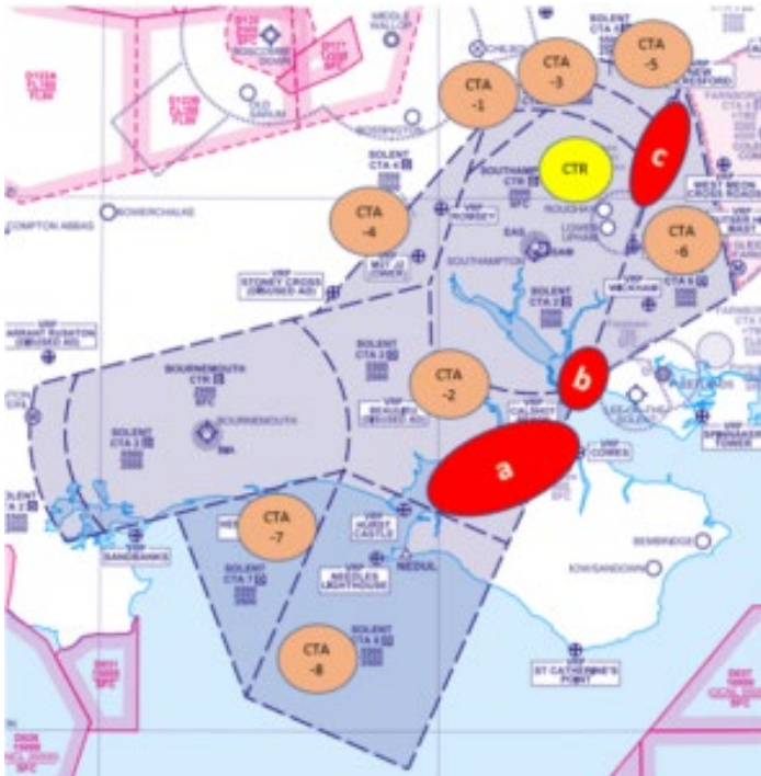
Figure 1 correct as at AIRAC 06/2023

There are three areas (as depicted in figure 1 by the red shapes a,b and c) in which most airspace infringements occur.